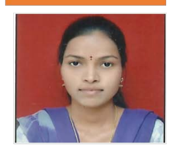
She completed the Tally course and has joined an architects office in Karjat as an accountant and earns